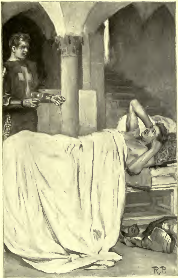
SIR GERVAISE FINDS HIMSELF LYING IN THE HOSPITAL OF THE ORDER.